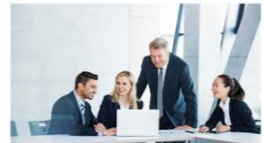
Exchange platforms for companies