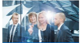
Interface between research and practice