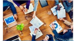
Support of research and teaching